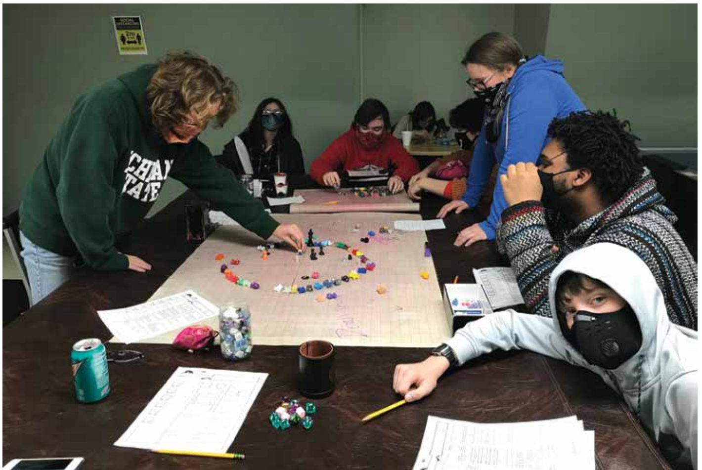
Dungeons and Dragons