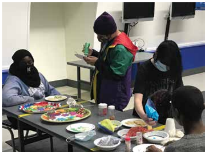
Decorating holiday cookies