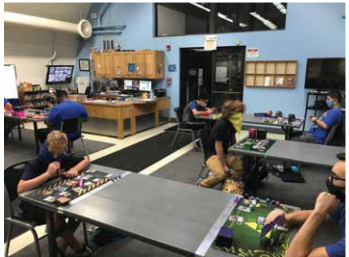
Magic: The Gathering